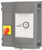
Classic Plus (standard)

The dock leveller is operated via the control system type Classic Plus included as standard. The components of the control system are RoHS-compliant (unleaded).