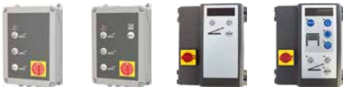
SuperVision 5 (standard)

The dock leveller is operated via the control system supplied along with it, viz. SuperVision 5. The components of the control system are RoHS-compliant (lead-free). The i-Vision control system is available as an option.